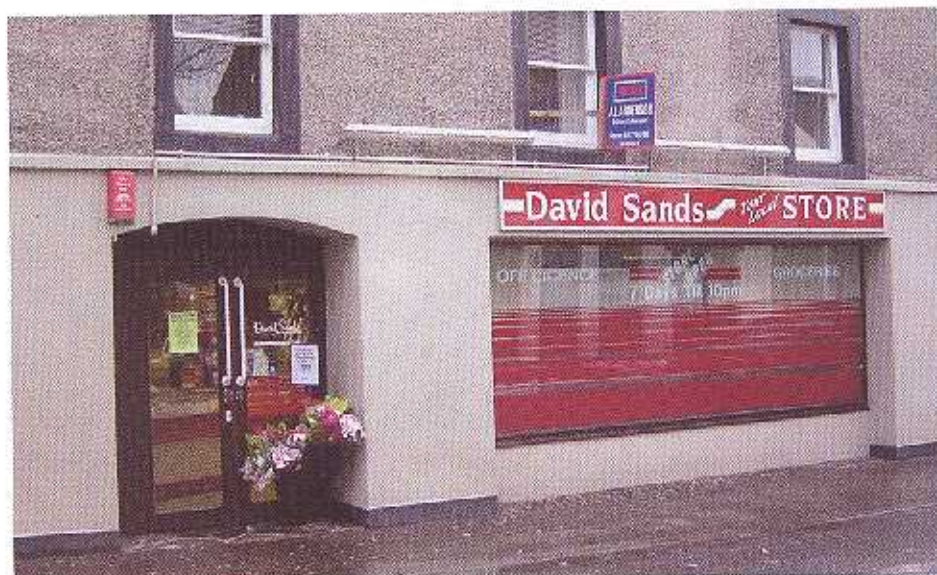
Scottish marketplace – David Sands Store

Below this superstore surface, however, Scotland continued to have some distinctly Scottish businesses. The Co-operative movement has traditionally long been part of the retail and social fabric of Scotland. Lothian and Borders and Scotmid Societies are large and strong competitors. In the convenience store market the growth of Abernethy in the north and Morning, Noon and Night in the east added to strong Spar franchises such as Botterfills. Small independent chains focusing on local village and small town markets, such as David Sands, add to the variety and the distinct sense of place. Retailing in Scotland at the local level maintained its Scottish roots. But with Somerfield buying Abernethy (in 2003) and Morning, Noon and Night selling to Sainsbury (in 2004), another shake-up seems to be in process.