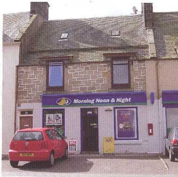
Morning, noon and night

Whilst this may be seen as overstatement, there is little doubt that Scotland was different, particularly in food. In the non-food retail businesses, the big cities had a powerful pull due to the scale of their markets. Retailers found Scottish consumers open to wider influences in non-food. Fashion businesses in Glasgow and to a lesser extent in Edinburgh were successful entrants to the market. Food retailing was different. Almost 10 years ago, however, Scottish food retailing was transformed by a major takeover battle. Tesco's winning bid for Wm Low gave it significant national (British) presence for the first time and relegated Sainsbury's, then the number one retailer and expanding, to also-rans in Scotland. In the wake of this takeover, the sense of Scotland being distinct and different was perhaps eroded. Large-scale food retailing in Scotland has since become dominated by Tesco and ASDA, though Safeway (once the number one food retailer in Scotland and now Morrisons-owned) remains a large third force. Food retailing fascias have become 'British', though product adaptation to Scotland has still been needed.